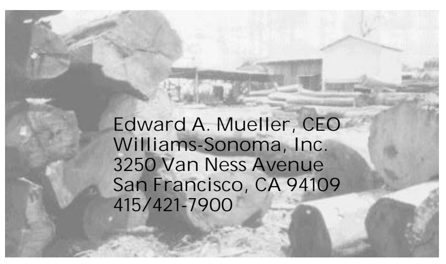
Pottery Barn sells furniture made from wood logged from the highly endangered rainforests of Indonesia. At least 75% of logging in Indonesia is illegal. Members of indigenous groups have been beaten and displaced by illegal loggers and the corrupt police that support the illegal trade.