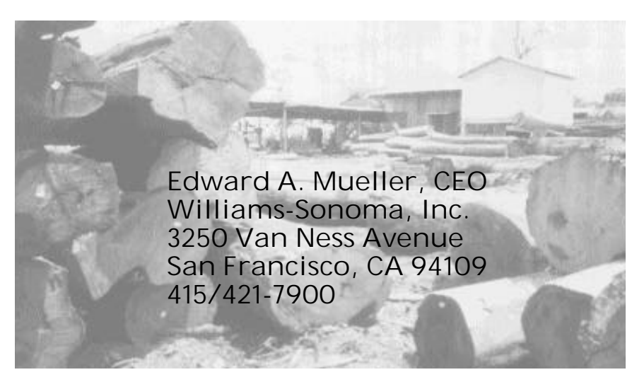
Pottery Barn sells furniture made from wood logged from the highly endangered rainforests of Indonesia. At least 75% of logging in Indonesia is illegal. Members of indigenous groups have been beaten and displaced by illegal loggers and the corrupt police that support the illegal trade.