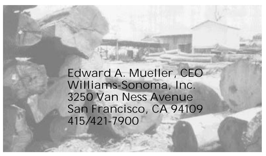
Pottery Barn sells furniture made from wood logged from the highly endangered rainforests of Indonesia. At least 75% of logging in Indonesia is illegal. Members of indigenous groups have been beaten and displaced by illegal loggers and the corrupt police that support the illegal trade.